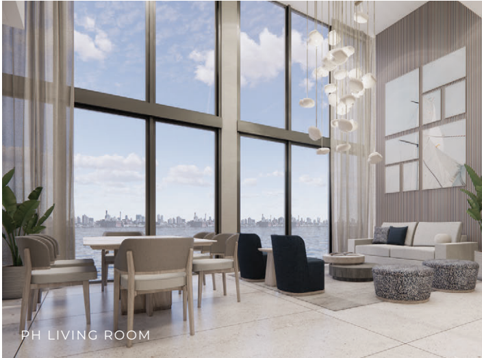
PH LIVING ROOM